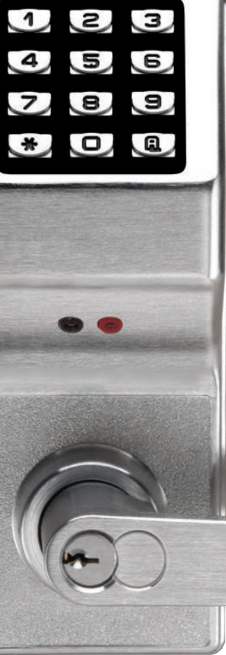
DL5300IC PIN Lock Front/Back View, shown