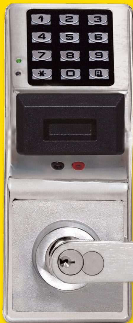
PDL5300IC Prox/PIN Lock front/back view, shown

Double-sided Trilogys for PIN code or prox access from 2 sides of the door